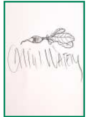
Alice Waters "Simple Food"

A very special Foodle was drawn by the late Julia Child. She generously had sent two for the 20 th anniversary auction, and so the one that was held in reserve took one of the top bids in a Foodle Auction that netted about $3300. What becomes a legend more?