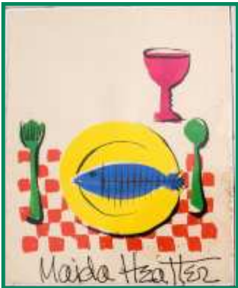
Maida Heatter "Fish Out of Water"