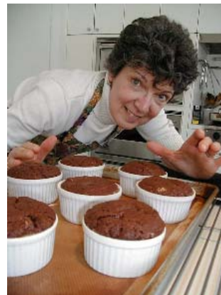
Dame Madelaine Bullwinkel