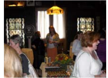
New members meet and greet.

The Chicago Chapter of Les Dames d'Escoffier welcomed its newest members from 2009 and 2010 at a reception on September 20, 2010 at The House of Glunz in Chicago. The new members, along with the Chicago Chapter Board of Directors and several long time Les Dames